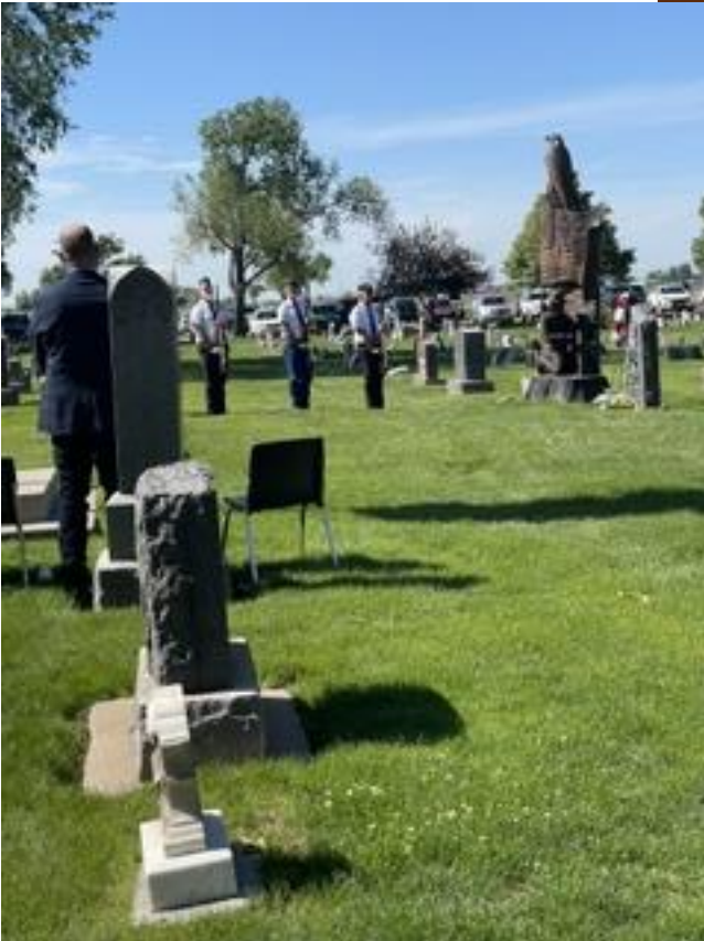
Memorial Day Presentation at Hillside Cemetery with the Community Choir