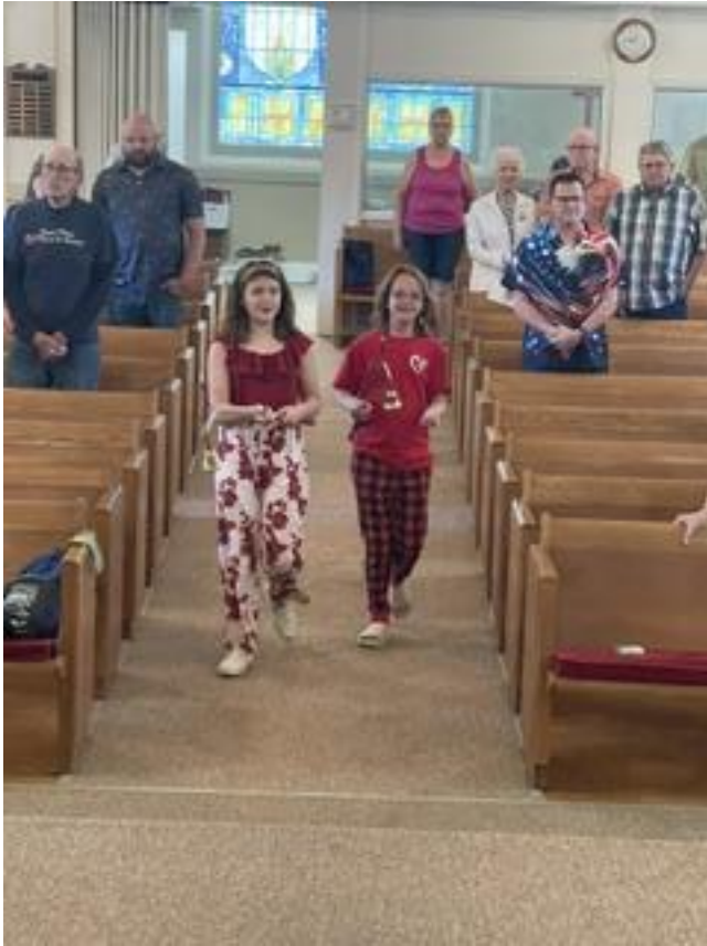
Bringing in the Light of Christ