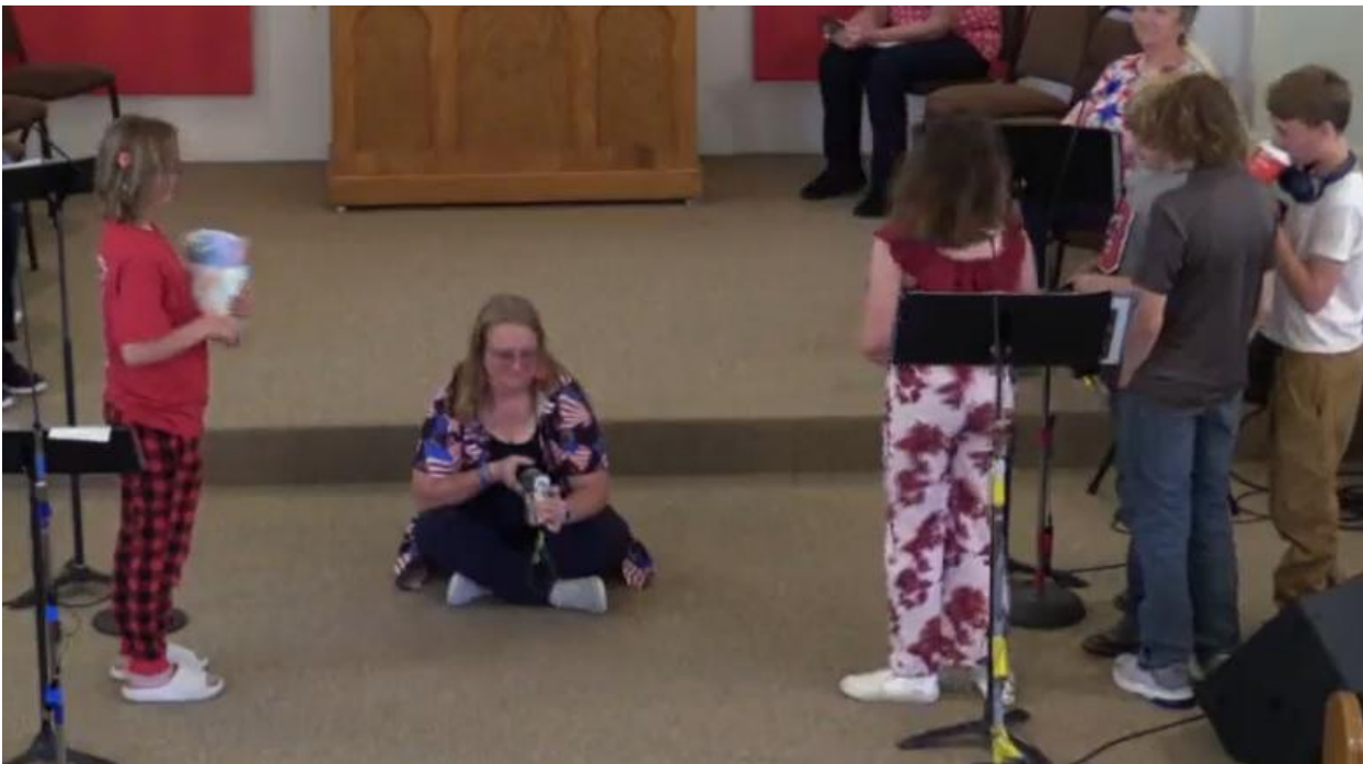
Was that French or Spanish?