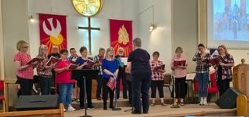
Choir giving us a sample of their Memorial presentation