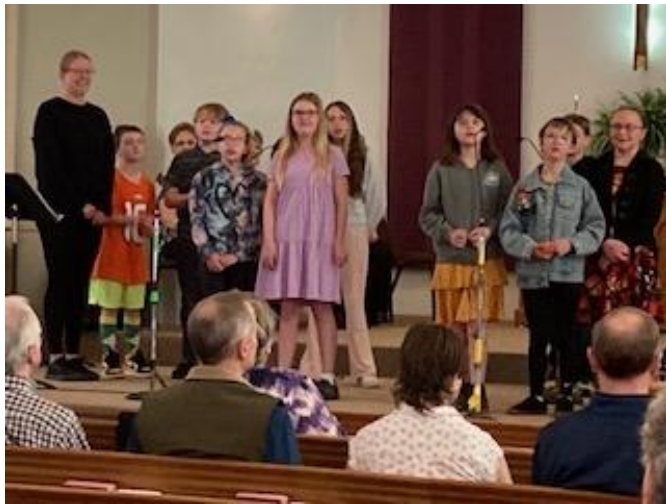
Children's Choir Singing