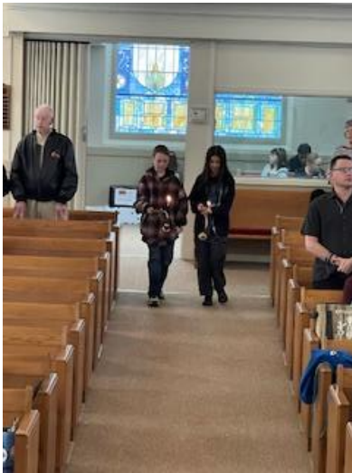
Sunday Worship Bringing in the light of Christ.