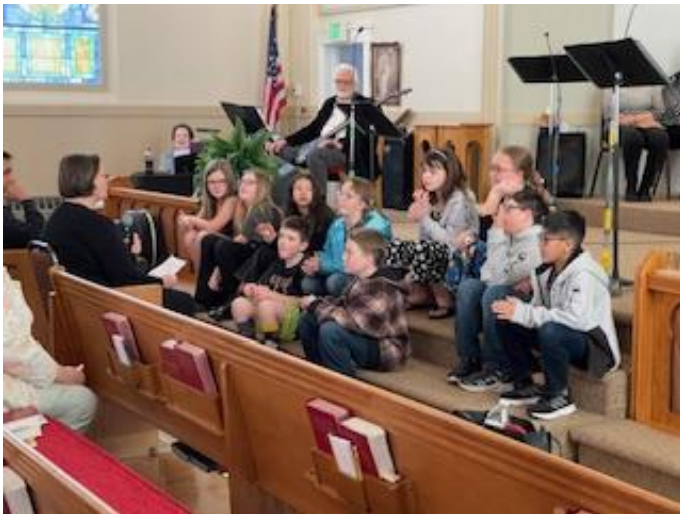
Worship and Children's Time.