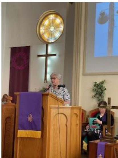
Friday Night Fun