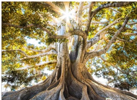
Putting Down Roots

→ First United Methodist Church of Fort Lupton