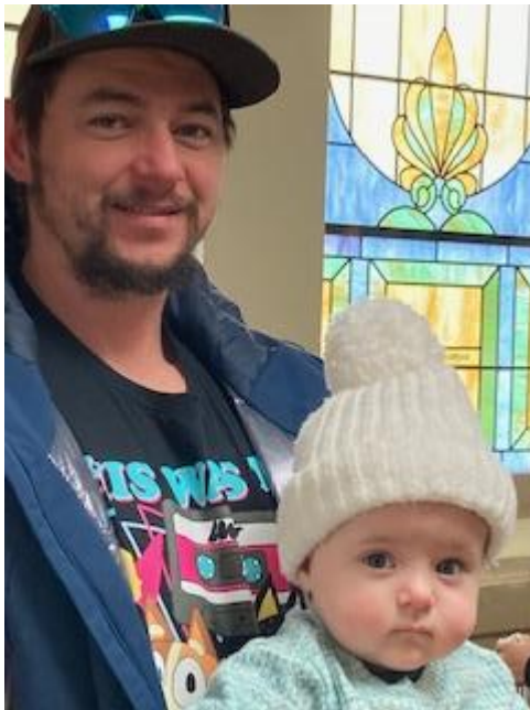
Worshipping on a cold Sunday morning.