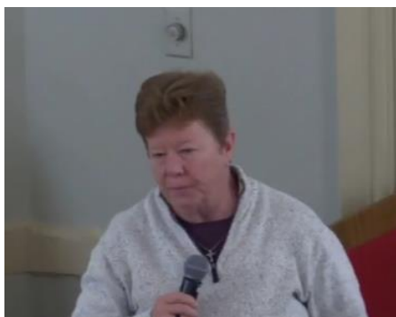
Mission Moment Hope @ Miracle House