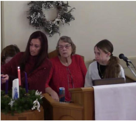
Cook Family lighting the advent candles.