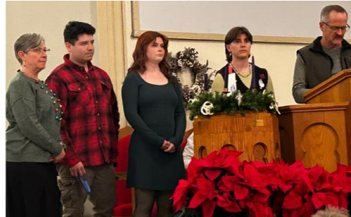
Norby Family Lighting the Christ candle.