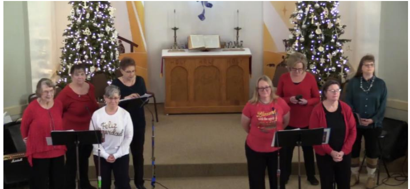
Praise Team lookin g festive!